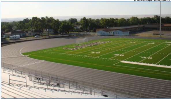
Laurel High School Sports Complex